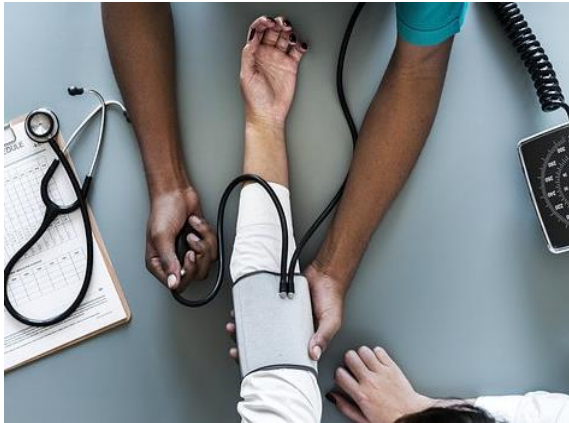
Improve patient care

SBRI is a pan-government, structured process enabling the public sector to engage with innovative suppliers.