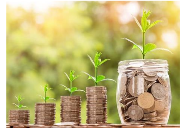
Bring economic value and wealth creation opportunity to the UK economy