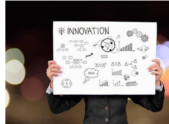
Enable the NHS to access new innovations through R&D that solve identified healthcare challenges and unmet need