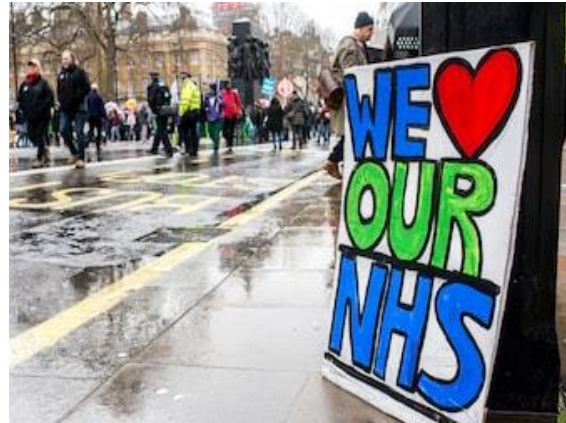
Increase efficiency in the NHS